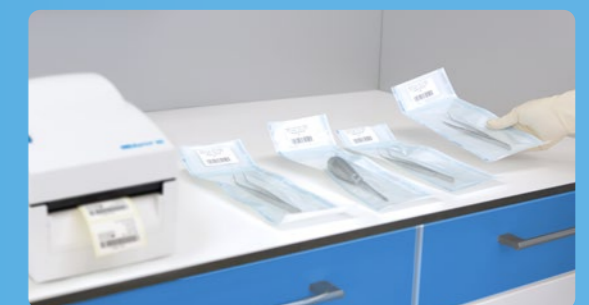
✓ Marking with MELAprint 80